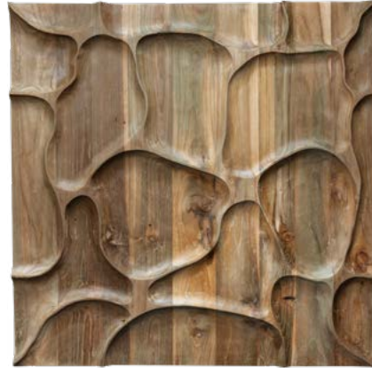
DUNE 1 45-01-IDN-TEA